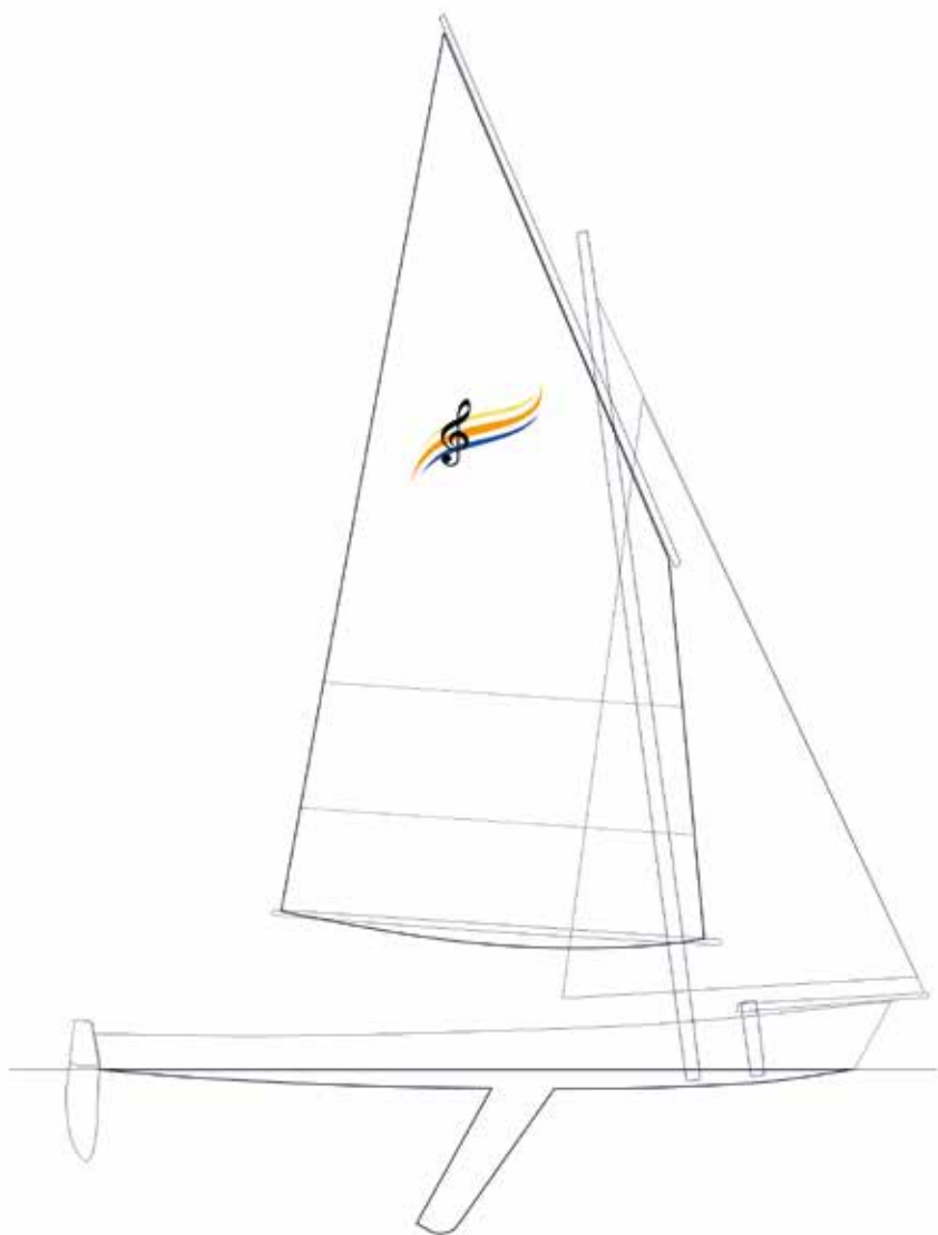
Windsong, Sloop Rigged