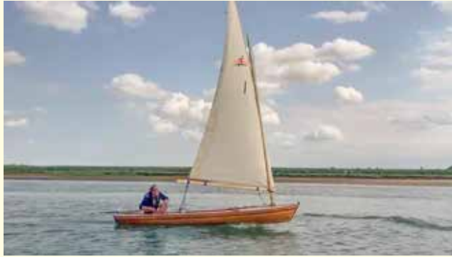
Windsong Cat rigged for solo sailing