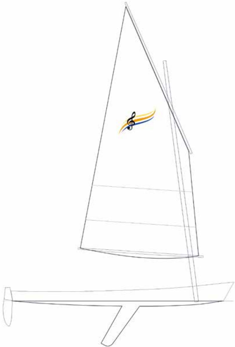
Windsong, Cat Rigged Mast in forward position