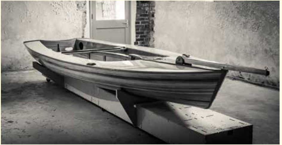
Windsong just before launch